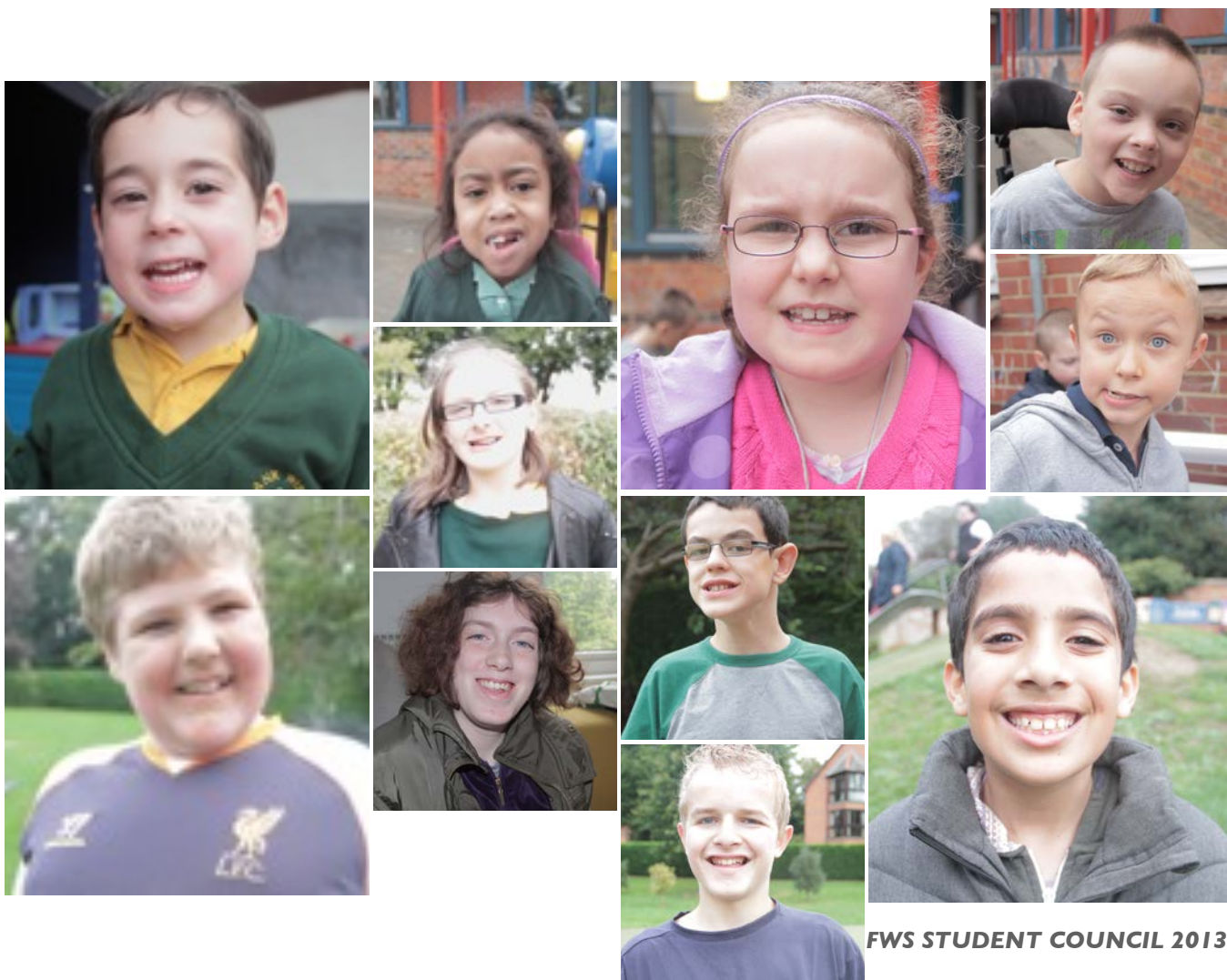
FWS STUDENT COUNCIL 2013-14