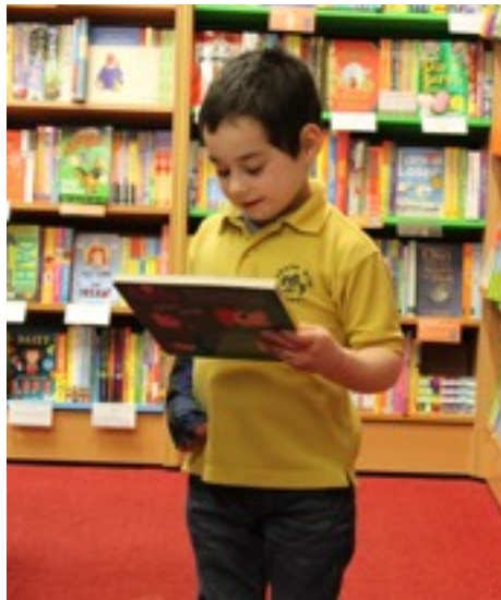
Student Council members visiting local businesses

represent the interests and concerns of their family group as expressed during regular class discussions. It will be the responsibility of council members to share any relevant information with their peers.