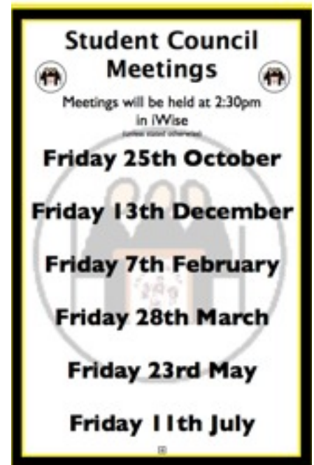
Example of meetings timetable